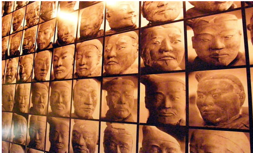
Terrocota In Xian