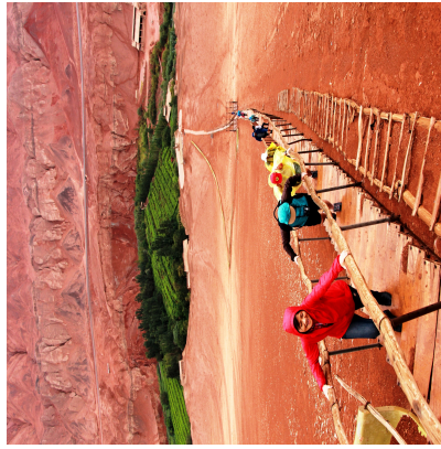
View from Tianchi/ Walk up 1308 step staircase at Flamming Mountain

Day 9 Urumqi: we bus to Urumqi (160km) approximately 2.5-3hrs. After check in we use the convenient public buses to move about in Urumqi. This leaves members the option to skip certain places and also to come back earlier. We visit Remnin Peoples Park to view hundreds of residents participating in various morning exercise routines. Later we visit the touristic Hongshan Park and the Xinjiang Autonomous Region Museum. We spend the rest of the day at the Erdaoqiao Ethnic Market and the Grand Bazaar. Great eating available at the numerous Uighur restaurants. Overnight (ON) Urumqi.