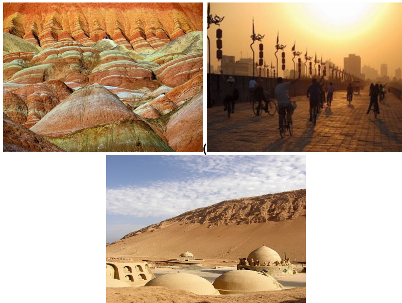
Danxia / Cycling at Xian Gate Wall / Turpan

Day 12 Hua Shan Mountain: This is a full day tour to one of five scared mountains in China, located 120km from Xian. There are some scary climbs up chained platforms. There are also cable car rides available for the regular tourist. ON Xian.